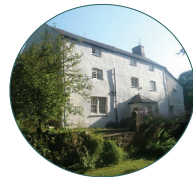
Church Farm Guesthouse

PLUS POSTMAN'S PATHS ON MITCHEL TROY COMMON