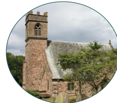
Church of St Michael and All Angels